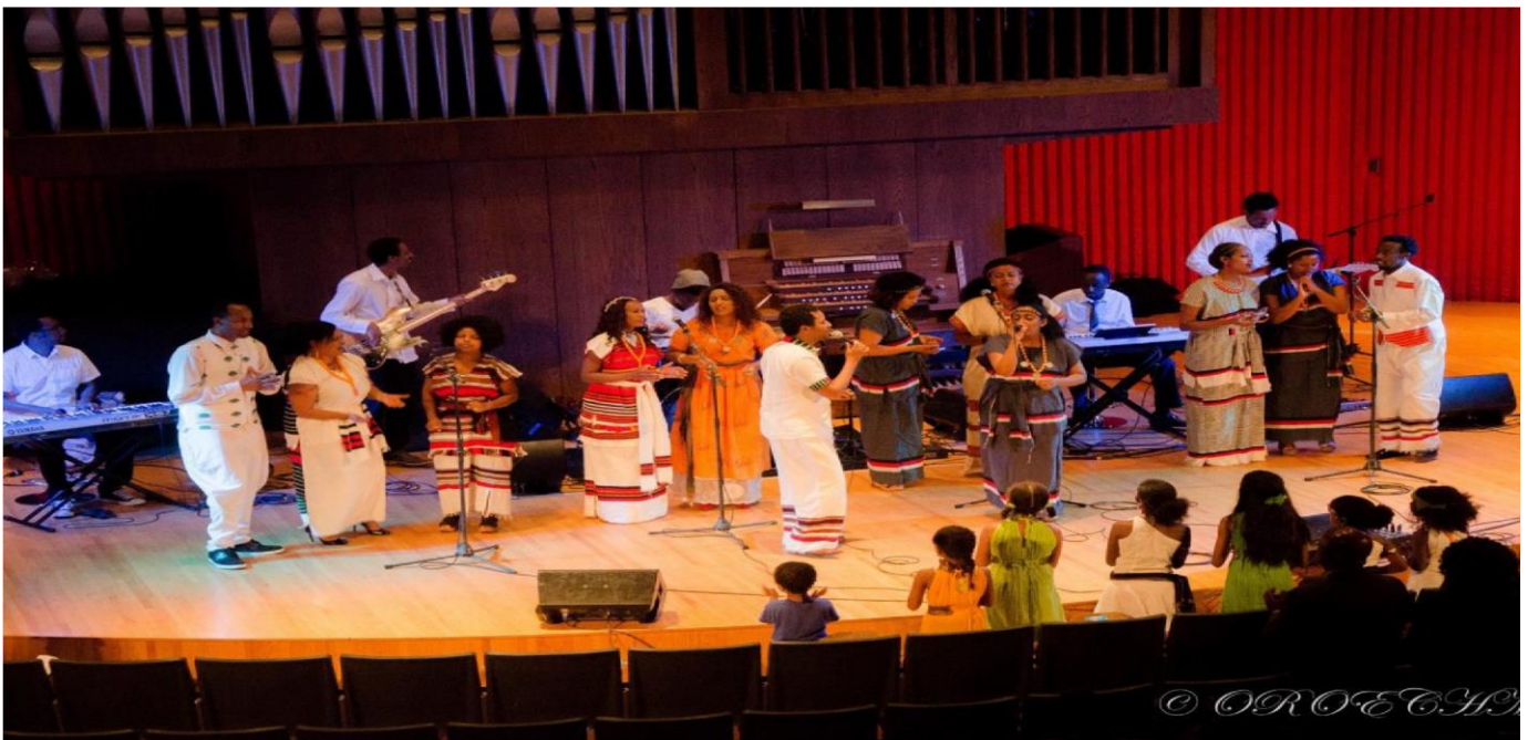
One of the many presentations during the concert at Concordia University Hall

A Spiritual Music Concert was organized by our church Worship Team held at Concordia University on. Well known Oromo spiritual singers participated in the concert, the first of its kind. It turn out to be a successful event and one of the means of outreach to our Oromo communities in the Twin Cities area.