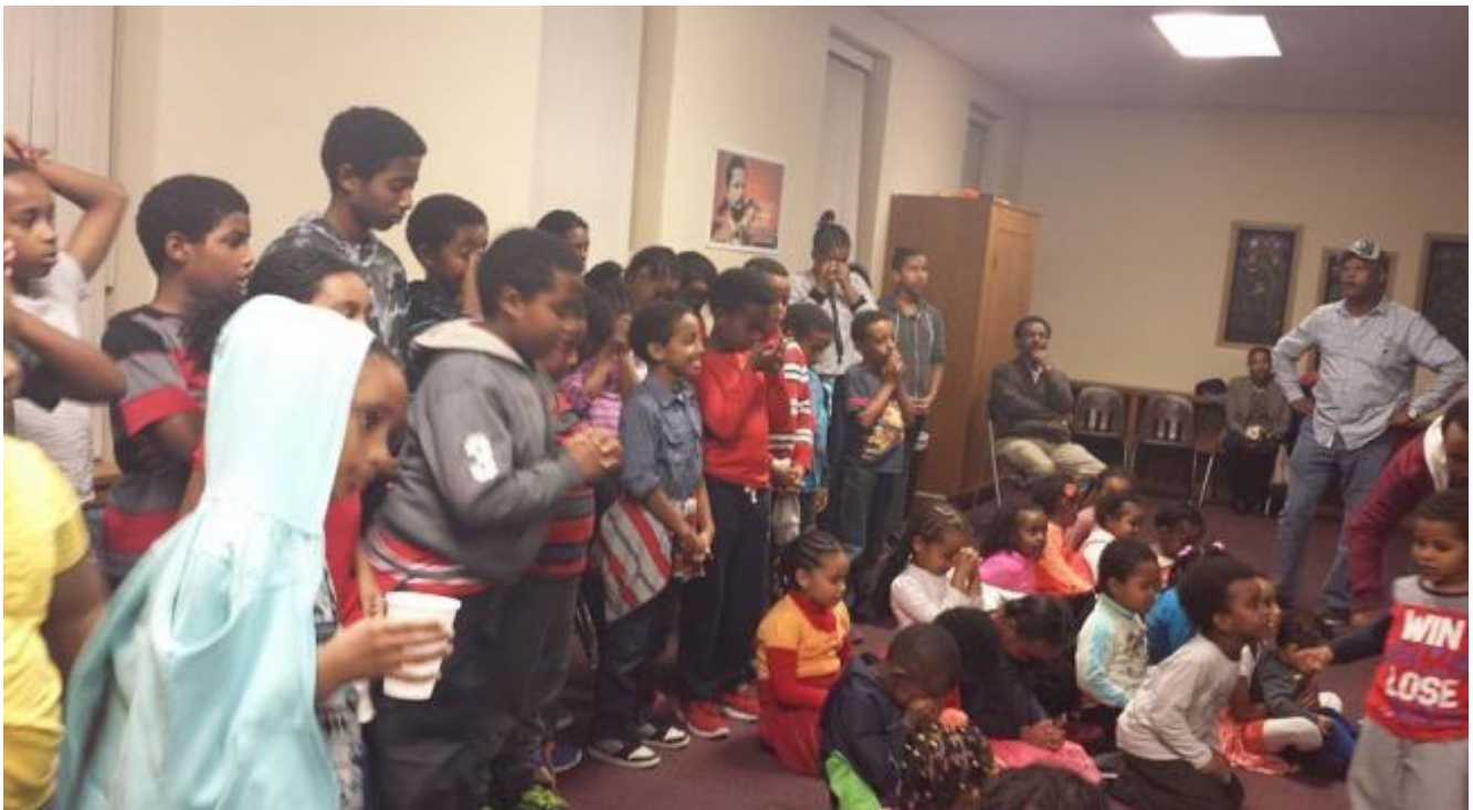
Hallelujah Night at OROECM

It has been several years since OROECM renamed the Halloween Night as Hallelujah Night and started organizing the yearly October 31 st celebration with appropriate program for the children of our church and their parents. This year close to eighty children and parents participated in the program of singing and fun for the children