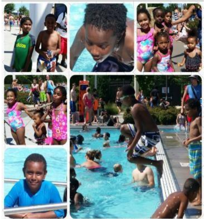
Children enjoying their Day Out in Swimming Pool.

A big thank you to all of our summer program participants, parents, youth group, and church leaders for helping to make the Day Bible Camp & Wapo Bible Camp a success. We had around 43 children who participated in the Wapo Bible camp for one week and over 50 children from pre-school to fourth grade who attended the one week Day Bible camp.