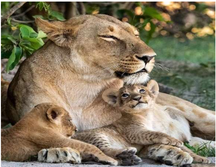
Among our God's mysteries of creation are the bond, love and care between mothers and newborns displayed even among domestic and wild animals and birds of the air.