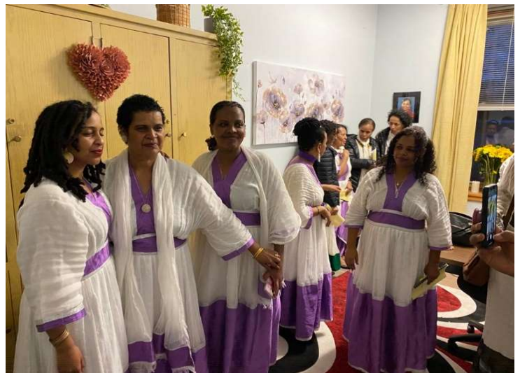
Family at the dedication.