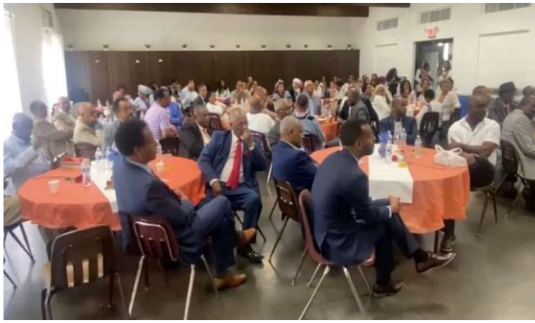
Seen from the celebration, 2023 Father's Day