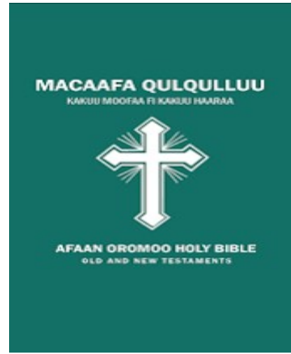
Onesimos Nesib, Nama Biyya Oromo