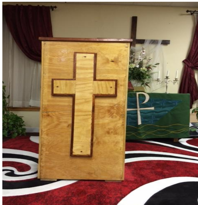
The new pulpit in Onisimos Nasib Chapel

in Abbaa Gammachiis' (Onisimos Nasib) Chapel.