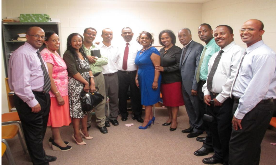
Visitors from OROECM together with the church leaders of Oromo

Let us hold fast to the confession of our hope without wavering, for he who has promised is faithful. And let us consider how to provoke one another to love AND GOOD DEEDS, NOT NEGLECTING to meet together, as is the habit of some, but encouraging one another, and all the more as you see the Day approaching (Hebrews 10:23-25)